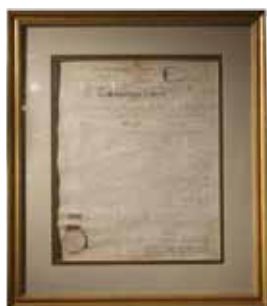
Western Star Lodge's original charter from Missouri

While most of California Lodge's archives were destroyed in the San Francisco earthquake and fire of 1906, a diary