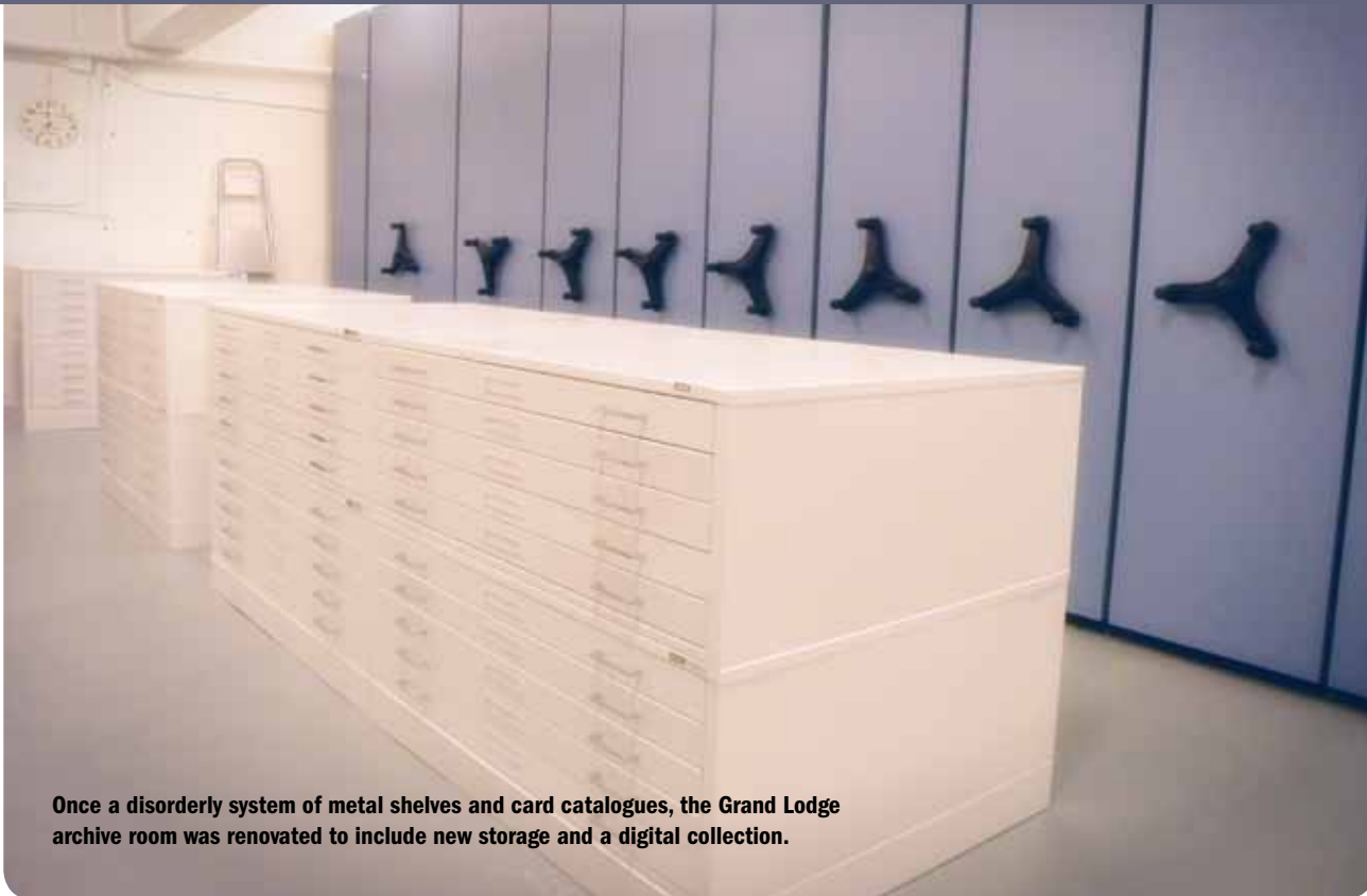
Once a disorderly system of metal shelves and card catalogues, the Grand Lodge archive room was renovated to include new storage and a digital collection.