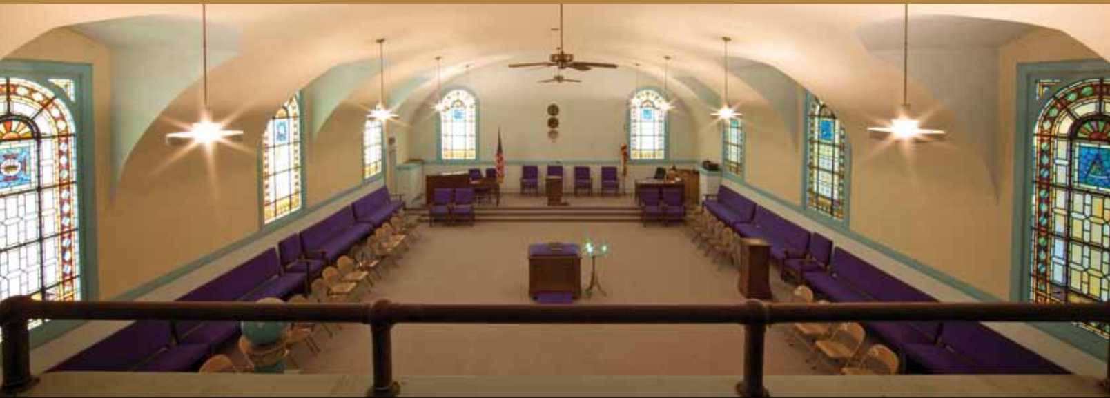
Light streaming through stained glass windows at Courtland Masonic hall will remain a fond memory for Franklin Lodge members.

from vandalism. But the windows today remain fragile, one-of-a-kind artifacts.