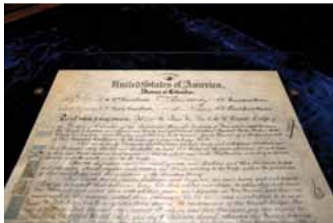
California Lodge's original charter from the District of Columbia