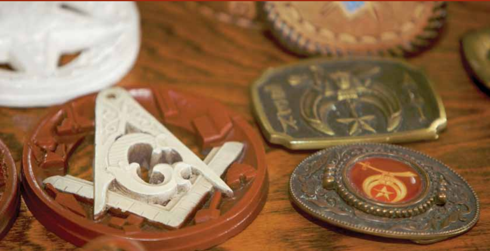
Rare Masonic items, donated over the years by residents, are preserved and displayed at the Homes.