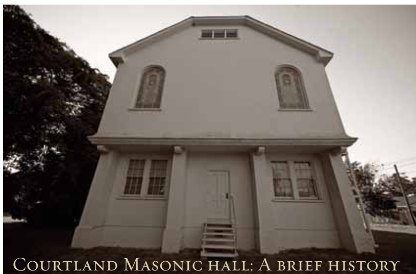
COURTLAND MASONIC HALL: A BRIEF HISTORY

Brewer says that in the late 1980s, the lodge added Lucite coverings to protect the windows